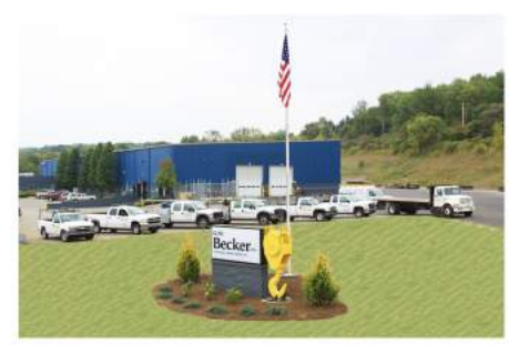
Production Facility 2600 Kirila Blvd., Hermitage, PA