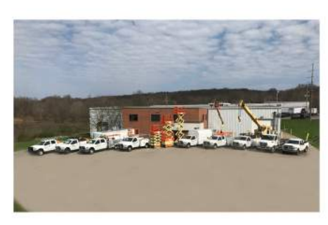
Sales and Service Facility 1565 Broadway Rd., Hermitage, PA