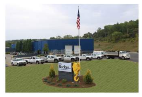
Production Facility 2600 Kirila Blvd., Hermitage, PA